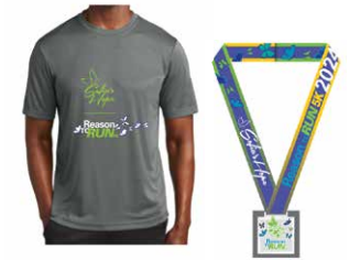
Official Race Shirt & Medal

Virtual participants will walk or run anytime/anywhere between October 26th – November 2nd, tagging Sofia's Hope using @sofiashope. All participants, whether in person or virtual will receive official race swag: official race shirt and medal.